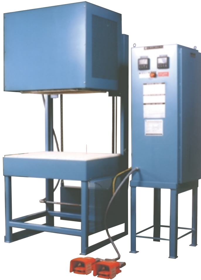
A WQ2 with a motorized lift.